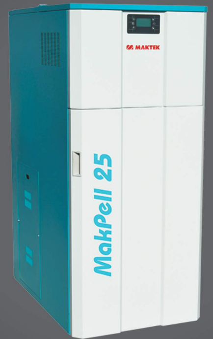
WOOD, PELLETT, COAL